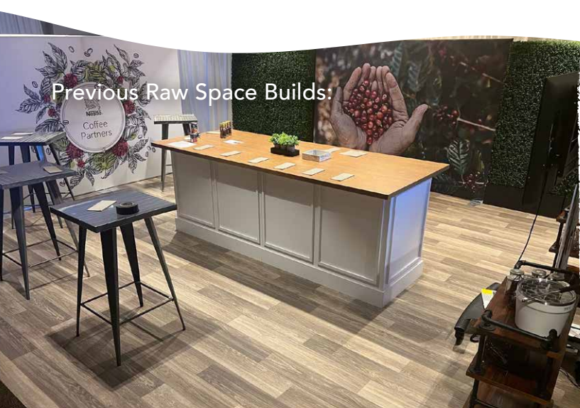
Previous Raw Space Builds: